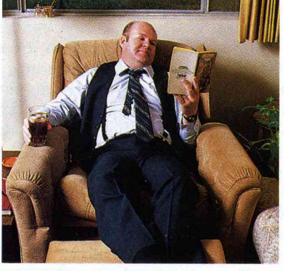
If battered by negative emotions, the body can break down and illness can result. But, just as negative emotions can wear the body down, positive feelings can build it up.

much less likely to become depressed or ill, or to die from the effects of hopelessness.