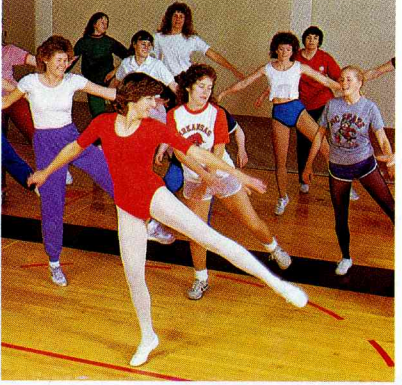
Occupying one's life with enjoyable activities is important, but to do so one has to be in control of his or her life. If not, trouble is ahead in the form of depression and resulting disease.

time. It is to be noticed that such an accurate description of this dread malady as it appears in the biblical narrative is not to be found in the literature of any nation for the next 1,700 years."