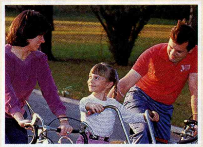
Principles of Healthful Living See page 9